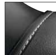
RTC with countersunk seams