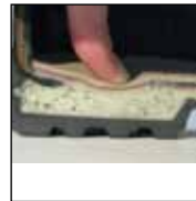
HAIX® MSL System